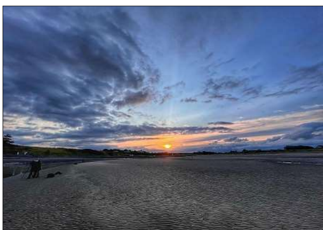
Sunset at Laytown Beach - Ciaran O'Rourke

We ran weekly outings over the summer months and below are two images from our recent trip to Laytown, County Meath.