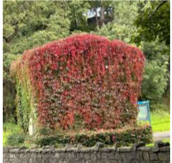
Virginia Creeper at Vesey Park