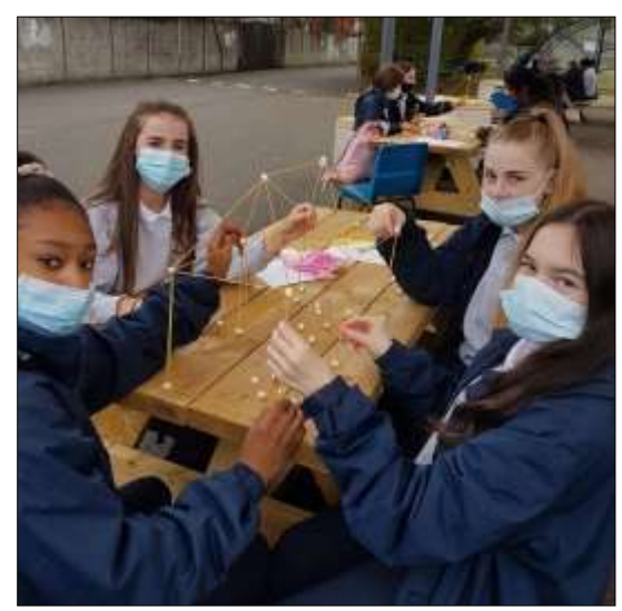
2<sup>nd</sup> year SPHE students 'Team-Building' exercises with spaghetti & marshmallows!

Context' exhibition at the National Botanic Gardens, Glasnevin. They had a lovely day viewing and sketching the many artistic sights on display.