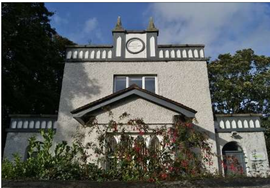
A crisp autumn day in Lucan, from St. Mary's Camera Soiree.

Mount Andrew: The boundary breaches between Mount Andrew and St Edmunds estate has been a long running issue and one that I have been working on. I am pleased that I got a commitment from Council management that they will bring forward a recommendation for resolution and repair by December's Area Committee meeting. This has been a long-running issue for local residents and I will continue to pursue it until resolved.