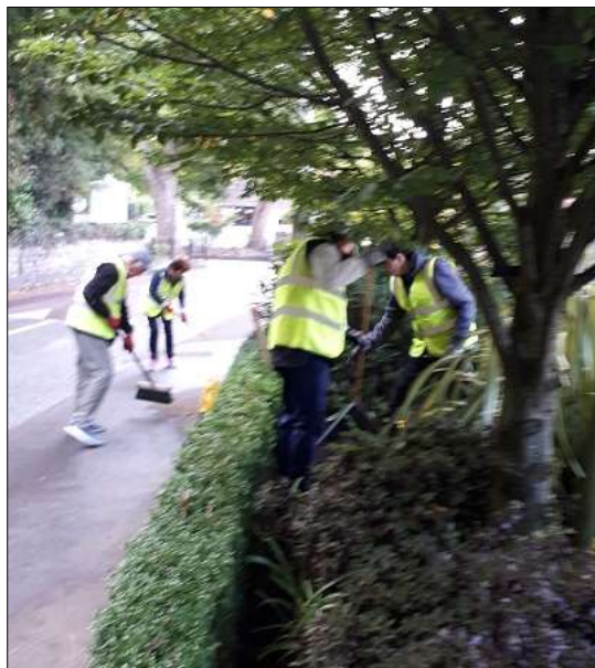
Hard at work on the flowerbed on the Adamstown Road.

It has been a pleasure for our volunteers to be out and about during these