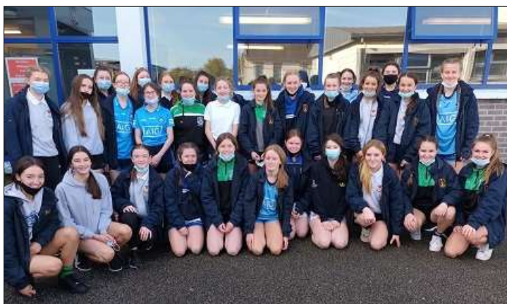
Our fabulous Junior Gaelic Football Team!

Congratulations to the Junior Gaelic Football team. They had a fantastic win on Monday against Santa Sabina from Howth. It was a very exciting, high scoring game. The final score was 5-19 to 6-06.