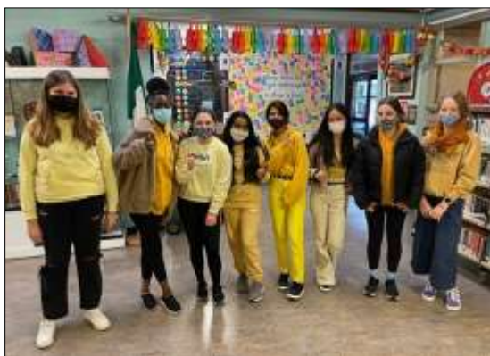
Third Year students wearing 'Yellow' underneath the 'Rainbow' Lanterns

This week was Stand Up Week , where we, as a whole school community made a stand against LGBTQI + bullying. The student council and TY students were busy making multi-coloured lanterns to "shine a light" on the issue of homophobic and transphobic bullying and all SPHE classes focused on the topic this week, learning about the correct terminology etc from a presentation developed by our school 'Skittles' group. We had the school decorated with various LGBT flags throughout and students were invited to wear any of the colours of the pride flag on a 'non-uniform' Tuesday. The result was our whole school was awash with colour, showing our support to all the members of the LGBTI+ community in our school!