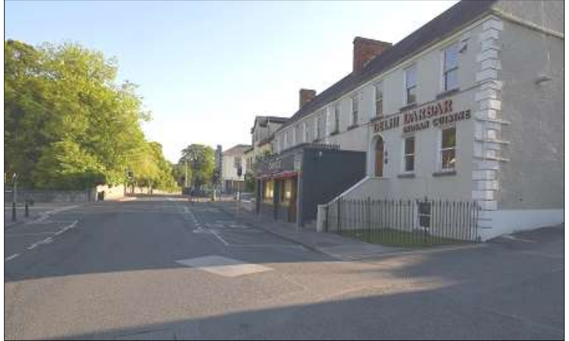
Lucan's main street at 6am

IN case you did not get to see the exhibition or have not viewed it on our YouTube Channel a random selection of some of the photographs that were in the exhibition are reprinted in this weekend's newsletter.