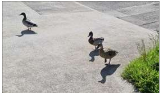
Ducklings in Beech Park

Have you ever seen so many ducks around the place? Ducks with their ducklings can be spotted all over Lucan, and some appear below in this week's Newsletter.