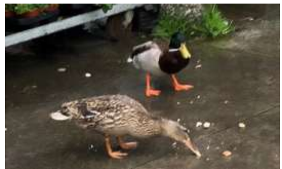
On a visit to Spar Dodsboro