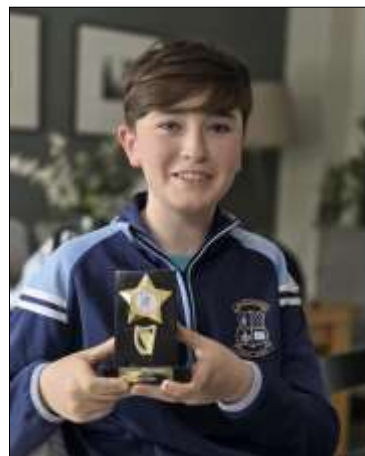
Photographer in the making....