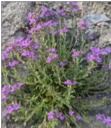
Fairy Foxglove on the wall near Canon Despard centre.