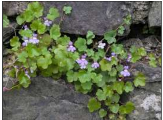
Ivy-leaved Toadflax ( on the wall down towards the village from opposite layby to opposite Circle K)