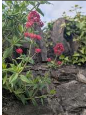
Red Valerian (near the Methodist Church)