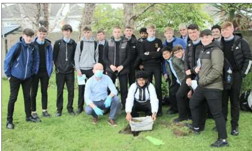
The Time Capsule unearthed