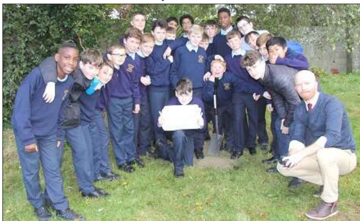
First Years bury the Time Capsule in 2016 Over .....

enclosed container was strong enough to preserve the items they buried in it.