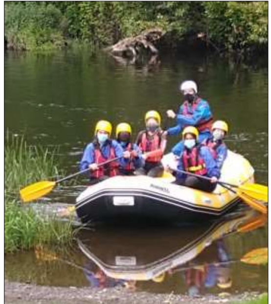
Land Ahoy! TY students rafting on the River Liffey!