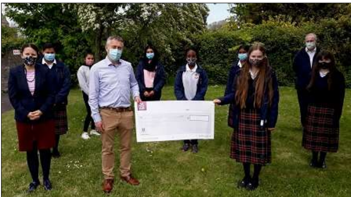
Our Parents' Association making a presentation to the Rosie's Garden Team.