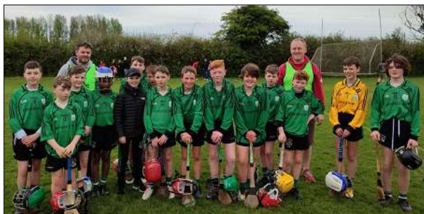
Lucan Sarsfields U12A