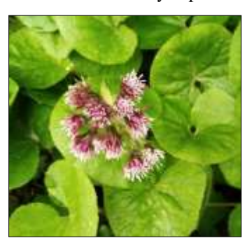
Until next week stay safe!

Kay captured what I understand is a Butter Bur along the banks of the Rye river. We are still waiting for some photographs from the continent from our member who is away at present.