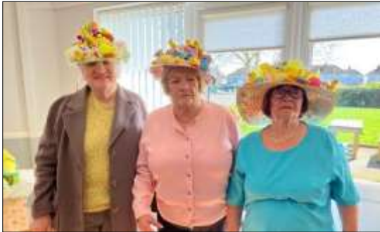
Above and Below – Winning Easter Bonnets