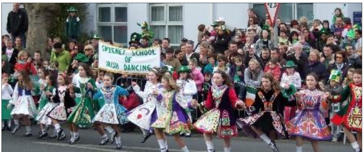
Twenty years parading! The Sweeney School of Irish Dancing