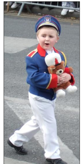
Leader of the Band!