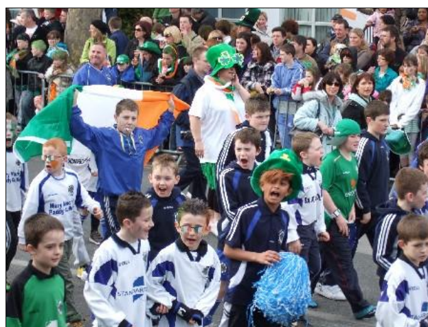
Above: Esker Celtic