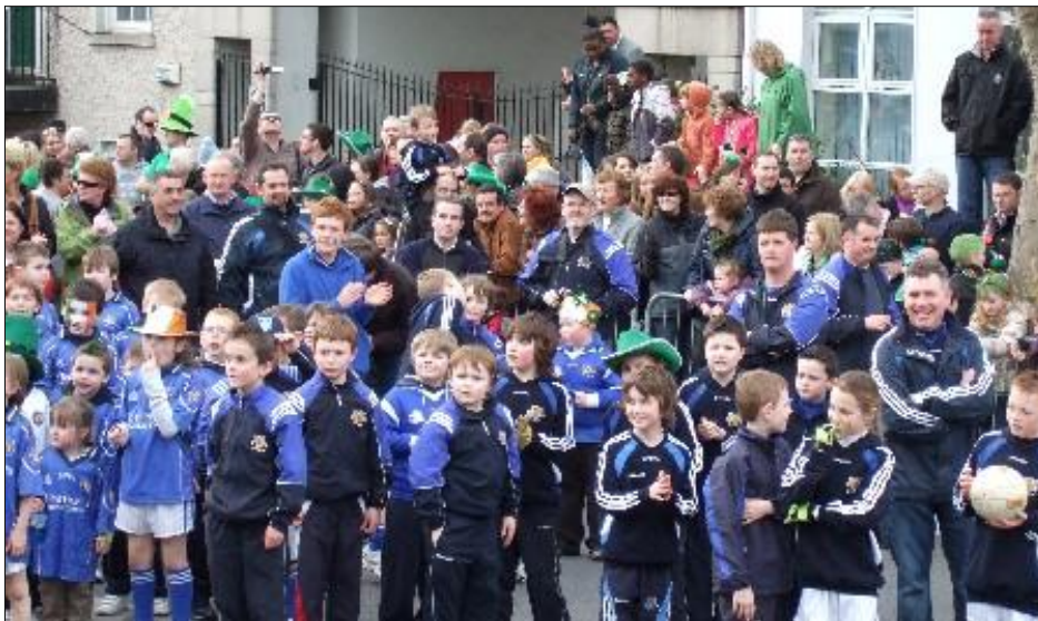
Westmanstown Gaels GAA Club were prize winners in Wednesday's Parade.