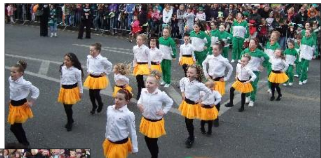
Above: Tara Dance Academy