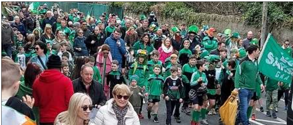
Lucan Sarsfields GAA Club – winners of the Peter Brady Perpetual Trophy