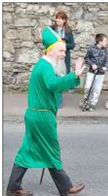
The main man!