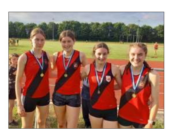
Lucan Harriers u18 gold medallists.