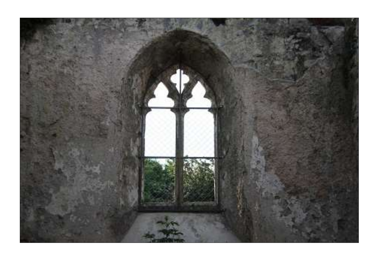
Until next week stay safe!