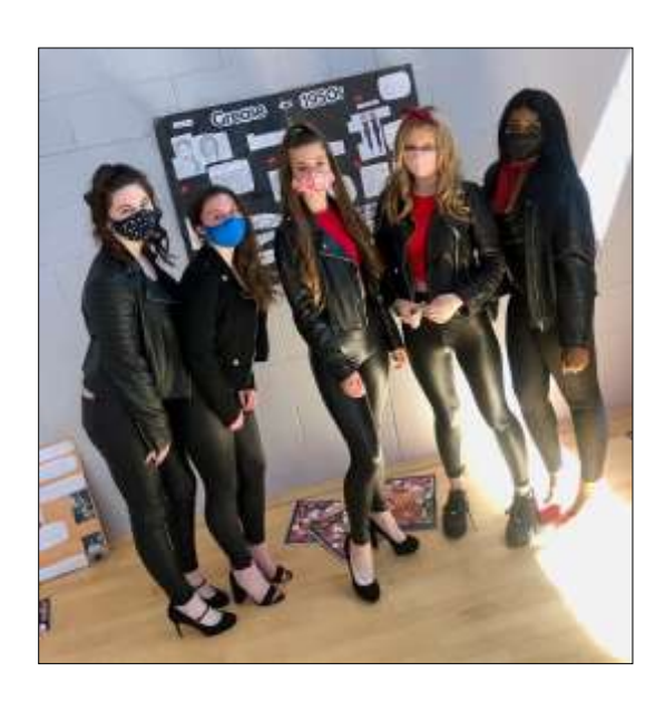
TY students modelled some iconic fashion trends at their end of year Fashion Show – Can you guess which one this is?

School website <a href="https://stjosephslucan.com">https://stjosephslucan.com</a> Follow us on Twitter: @STJosephs3