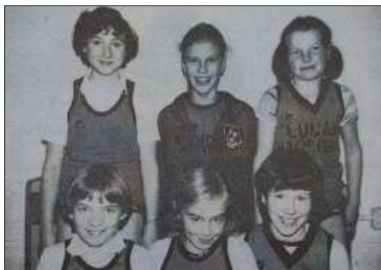
Above: An Under 10 Girls Team.

While the new athletics track was under construction, the club were very busy with events in all age groups.