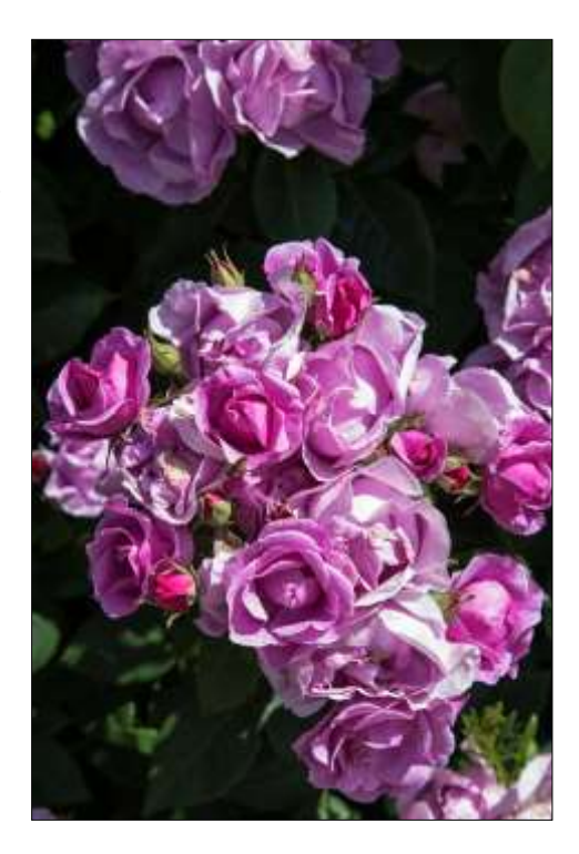
Until next week stay safe!