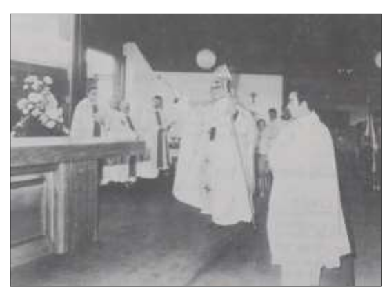
St. Patrick's Church in Esker was consecrated on 6th October 1985.

Masses: There were 7 Sunday Masses in Lucan, and 6 in Esker, which were celebrated in St. Anne's School as the new St. Patrick's Church was under construction.