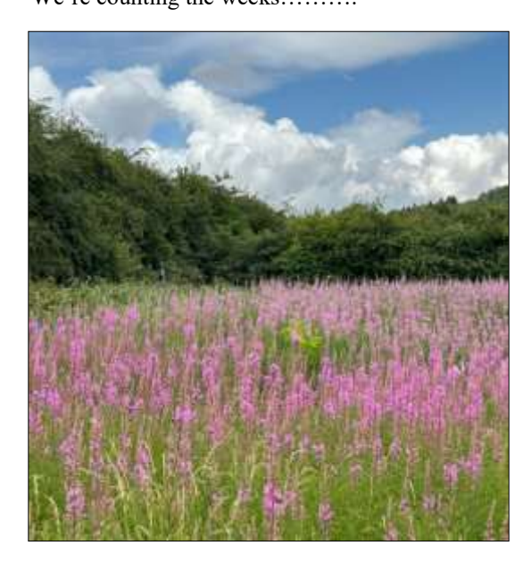
Oh, what a beautiful morning with the pretty Rosebay Willow Herb, in St. Catherine's this week!