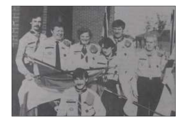
142 <sup>nd</sup> Esker Scouts – The above leaders received their commission on Sunday 15<sup>th</sup> September.