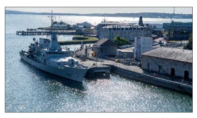
Until next week stay safe!

Donal submitted a photo of Haulbowline island in Cork harbour. The world's first yacht club was founded there in 1720. The western side of the island is the main naval base for the Irish Naval Service.