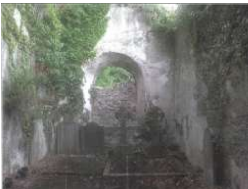
Photo of family burial place