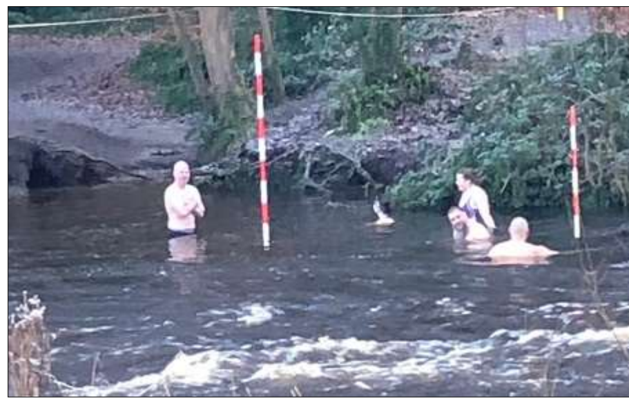
But something was missing......