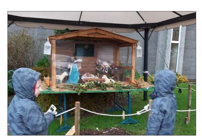
The outdoor crib at St. Mary's proved a great attraction for little people.