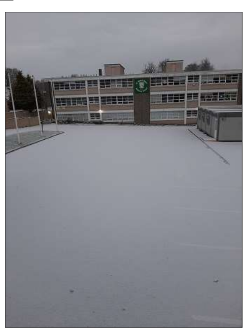
Not a footprint in sight at Lucan BNS!

Weston Crescent, who were awarded 2<sup>nd</sup> place in Energia's Most Christmassy House competion. They succeeded in winning €4,000 for their Temple Street Children's Hospital fund. Can't wait to see this year's display!