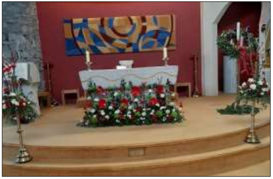
The flower fairies did a wonderful job again in St. Mary's for the Christmas Season. God bless their hands.