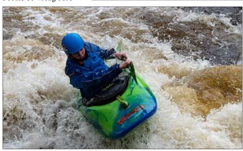
Until next week stay safe!