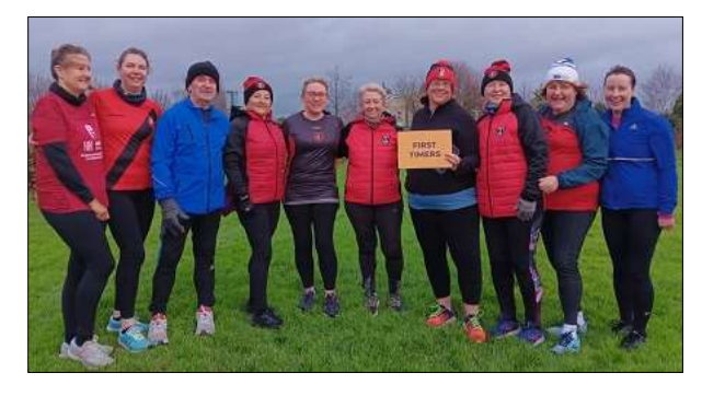
Original Fit4life members from 2014

Lucan Harriers Fit4life 10th Birthday Parkrun celebration: Lucan Harriers Fit4life group met up at Griffeen parkrun to celebrate its 10th birthday on January 20th.