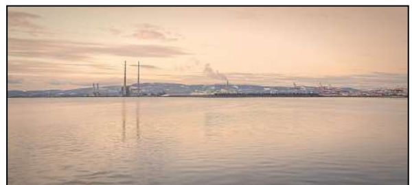
Dublin Port