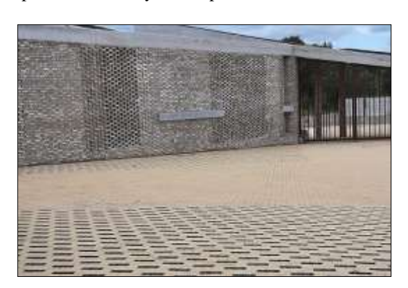
Thought we were looking at some ancient site here, but this is part of the new Esker Lawn Cemetery!