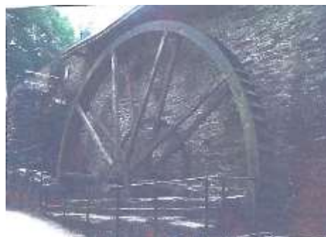
Typical Water Wheel Lucan Iron Mills had 8 wheels.