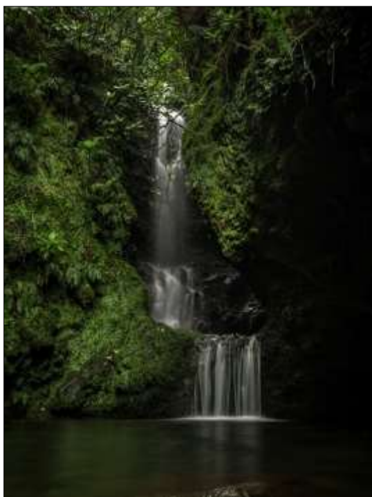
Intermediate. “Poco Del Pulgas - Orla Brady”.