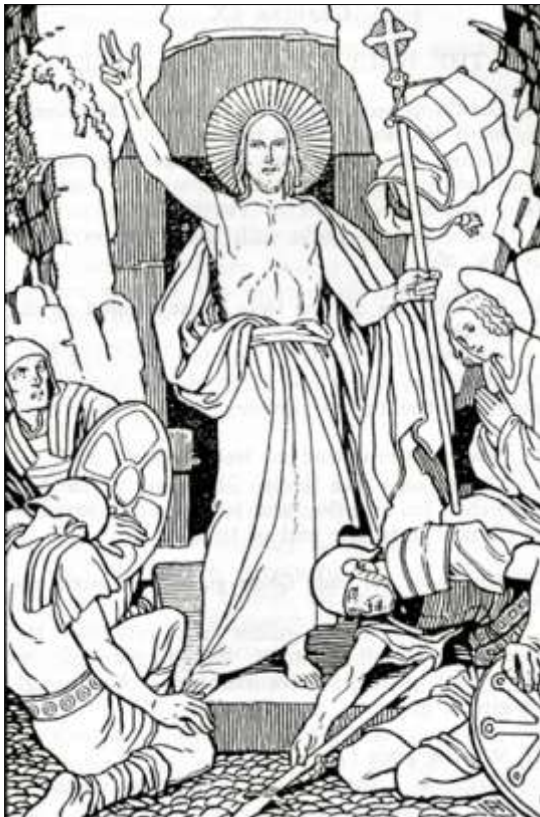
Jesus rises from the dead

The green covered A Catechism of Catholic Doctrine was introduced to the primary schools of Ireland in 1951, and contained questions numbered up to 438, which had to be learned off, word for word, and these questions would also come into play at Confirmation time.