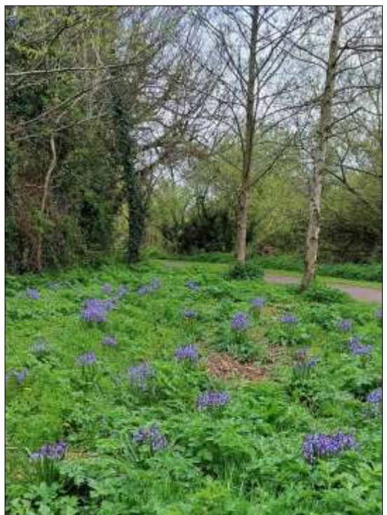
Woodland Blue Bells in April