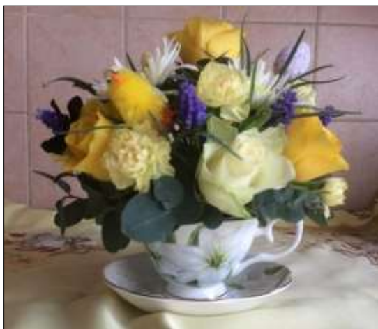
An Easter Floral Arrangement from Lucan Senior Citizens Club