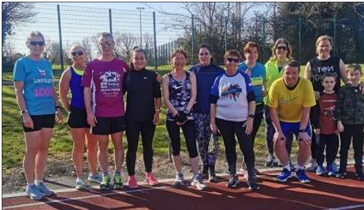
Members of Lucan Harriers crew