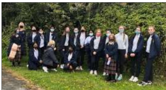
6 th year PE students participating in the Nano Nagle Virtual Walk

Participants were invited to walk 5km each day and post pictures of their walks or walking times. We remember this fantastic woman who was the light in so many lives and we hope we can continue to shine forth the light in what we do, being part of the wonderful Presentation Community.