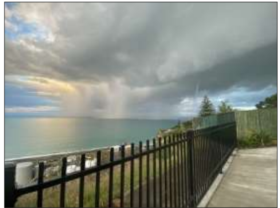
The storm looming off the coast of Napier

Our correspondent hid in from the storm, and like us just admired the photos, and also watched the TV coverage!