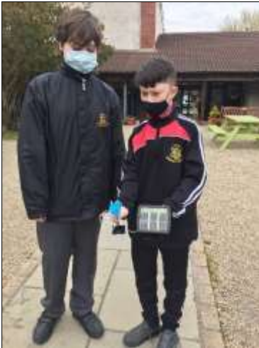
First years carrying out energy conversions using solar energy in our school garden.