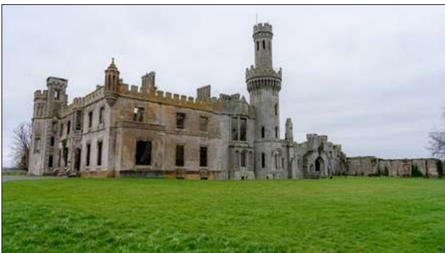
Returning to Donal's photo last week of Duckett's Grove, a ruined 19 th

century great house in county Carlow another view of the house is included this week. The house was built around 1745 on an estate covering more than 5,000 acres (20 km 2 ) of the Carlow countryside. Originally, the structure was designed as a standard two-