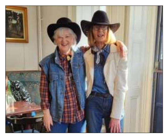
Two of our members won really good spot prizes so we all went home happy.

On Friday last over 20 of our members went to a fundraising night for Divine Mercy Junior and Senior schools at the Spa Hotel. It was a Garth Brooks tribute event, so we had a brilliant night of music and dancing. Our table was even awarded a special spot prize for having the most dancers on the floor!